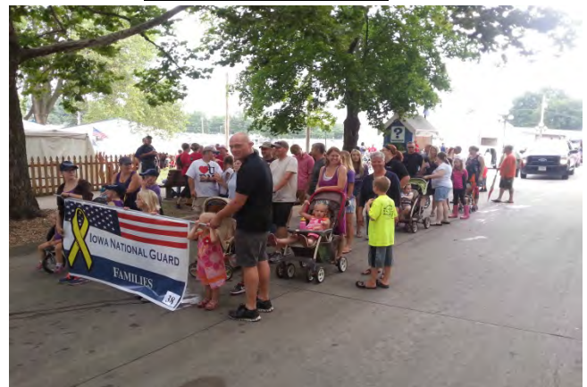
Families of the 132 nd Wing march in the Veterans Parade at the Iowa State Fair.

DISCLAIMER: The following articles are provided for informational purposes to personnel of the 132d Wing. It is not an endorsement by the 132d Wing, the Iowa Air National Guard, or the United States Air Force. Personnel are advised that listed information/offers may change without notice.